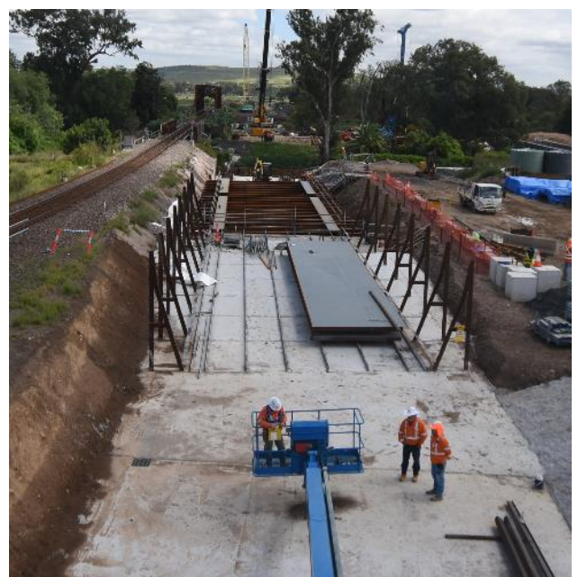
Photo: casting yard

Lighting towers will be used to continue the works safely at night and will be faced away from residences and Bridge Street.