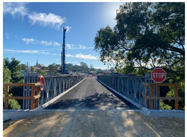
Photo: Temporary construction access bridge over Muscle Creek

The temporary construction access bridge over Muscle Creek is now complete. This bridge provides construction access into the 'Island' between Muscle Creek and Hunter River.