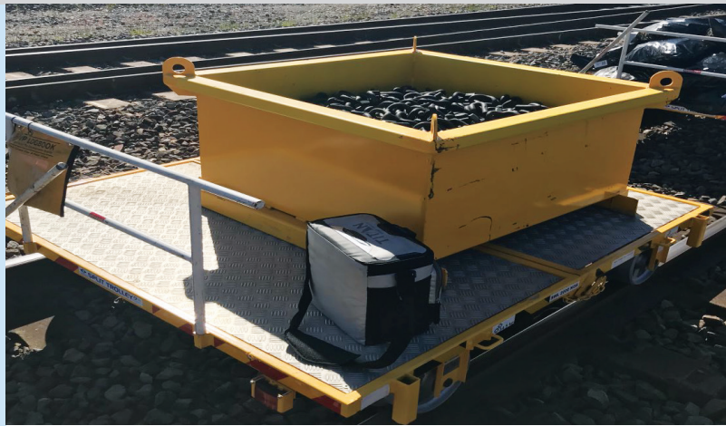
Rail clip delivery tubs in action during on of ARTCs maintenance periods.