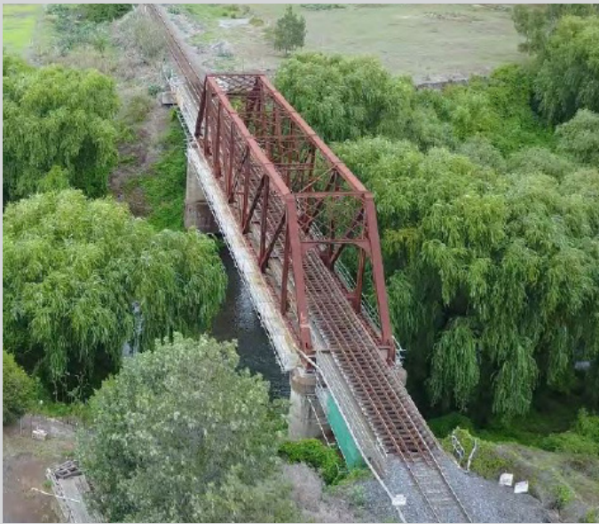
The current Hunter River Bridge - looking west over the Hunter River.

It is expected that the project will take two years to complete and support over 200 jobs. ARTC delivers more than $100 million worth of maintenance and construction work annually in the Hunter Valley.