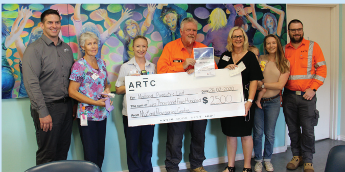
In February 2020 the Hunter Valley team presents the cheque at Maitland Hospital.

Each year we support worthy causes within our local communities, ARTC receive partnership, donation and charity requests of a varying nature every year. If you have would like to apply for support please visit www.artc.com.au/community/community-investment/ .