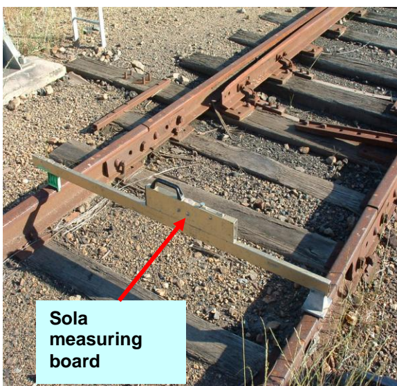
Photograph # 1

Track personnel to exercise more care when using the Sola measuring board to ensure incidents of this nature cannot occur.