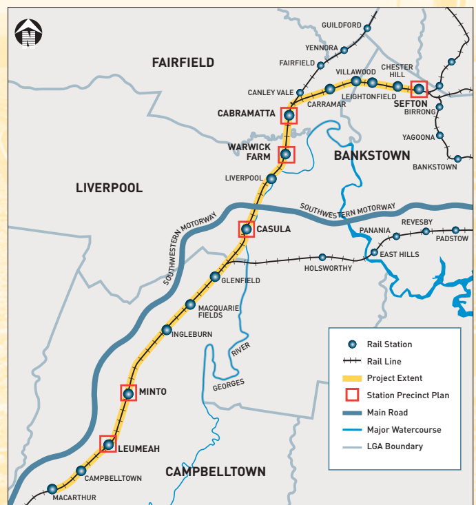
Figure 1 The Proposal

Figure 1 shows the location of the proposal and the rail stations that would require modification.